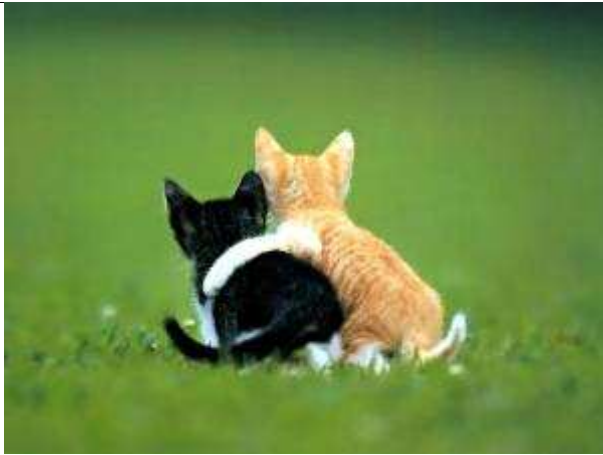
Despite everything...its good to have friends like these.