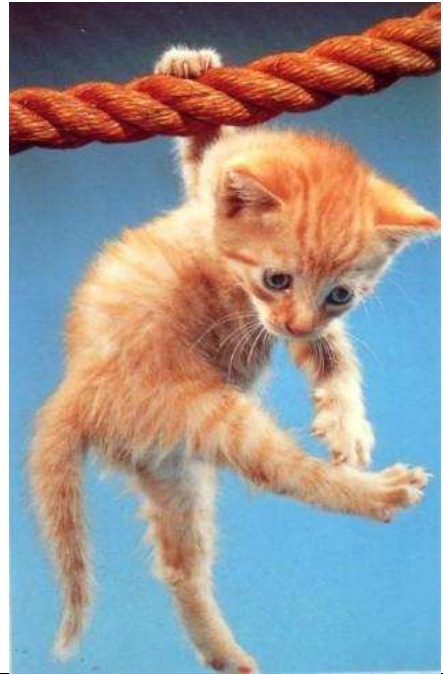
And we're dropping off at home.