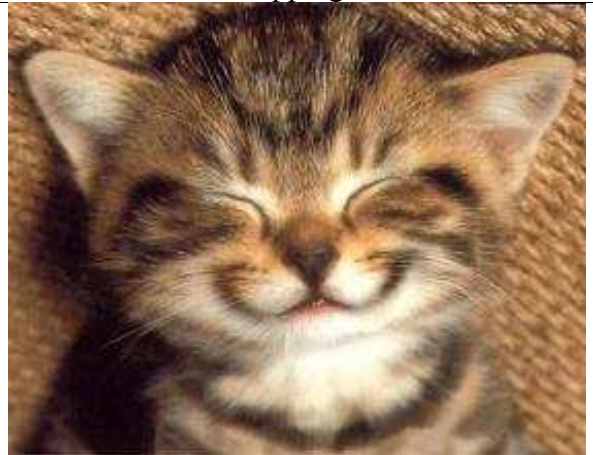
And get a good nights rest.