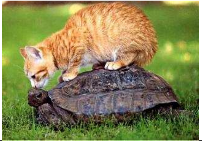
...made new and interesting friends...