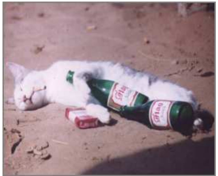
...until we finally passed out.