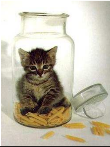
...we played some strange games...