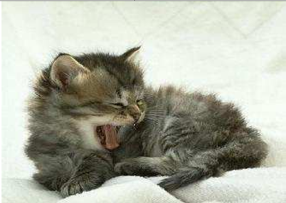
BECAUSE I HATE THE MORNING AFTER!!!