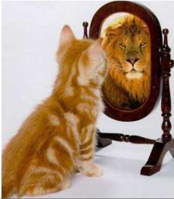
One last look in the mirror.